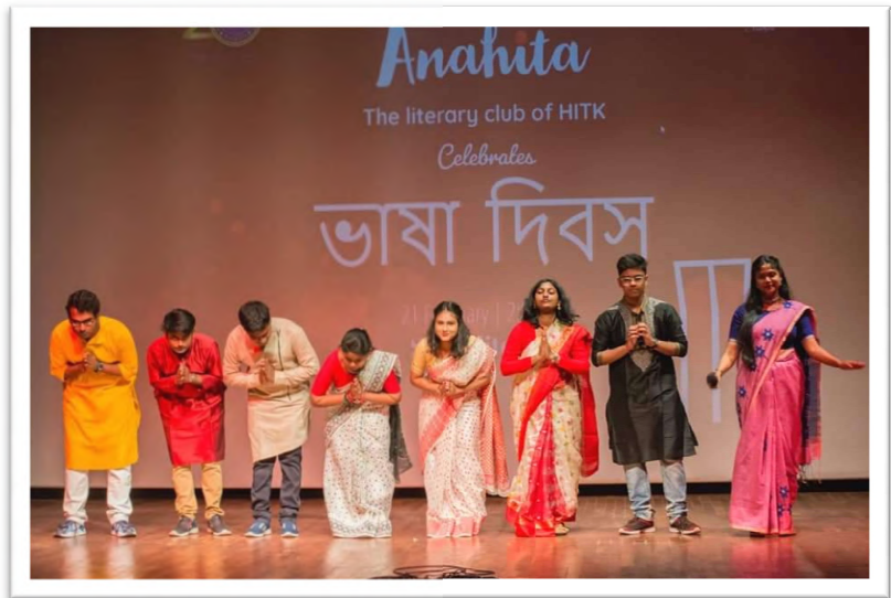
The Literacy Club of HITK (Anahita)