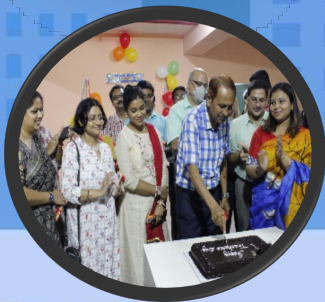
Teachers' Day Celebration