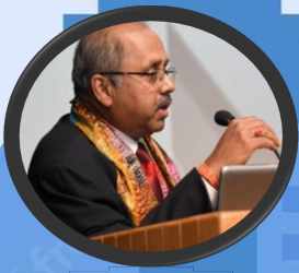
IPA Student Chapter