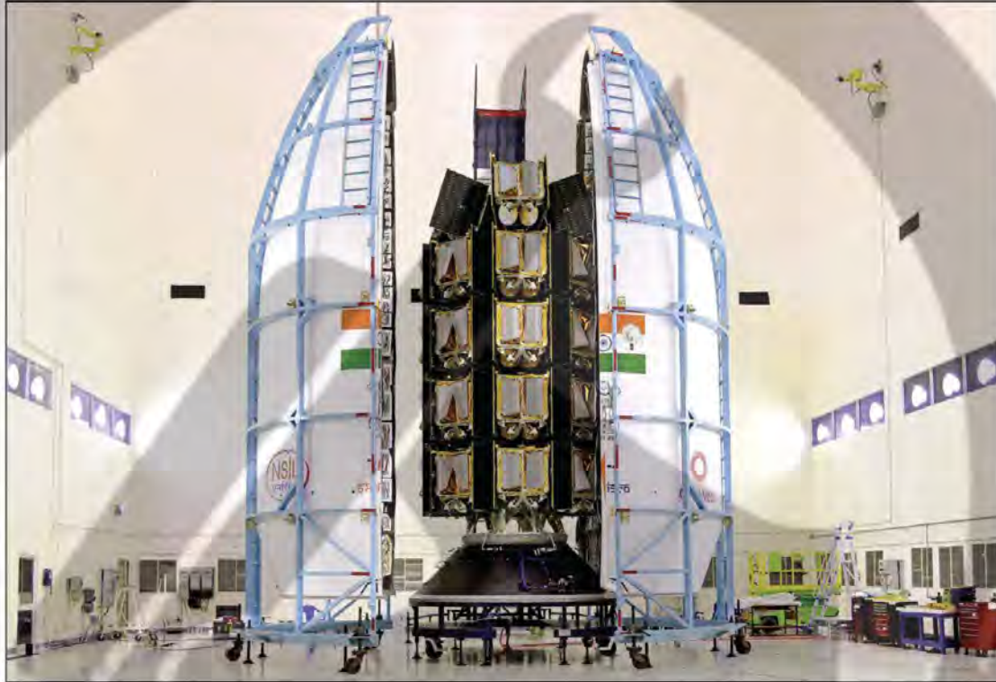
OneWeb India-1 Mission

The NSIL is enabling Indian Industries to scale up a high-technology manufacturing base for space programme through technology transfer mechanisms and catering to emerging global commercial small satellite launch service market, satellite services for various domestic and international application needs and enabling space technology spin-offs for the betterment of mankind through industry interface.