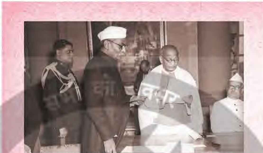
First President of India Dr Rajendra Prasad administering the oath of office to Sardar Vallabhbhai Patel as the first Home Minister

The years following the withdrawal of the Non-Cooperation Movement had seen a palpable demoralisation spread among all sections of people and even worse the rise of communal divisions in society. Some were disillusioned with Gandhi's leadership whereas some others found communist and socialist ideologies more appealing. There were divisions emerging within the Congress among the 'pro-changers' and the 'no-changers' and the spectre of a split loomed large. It was in these years that the 'Sardar', the leader of masses