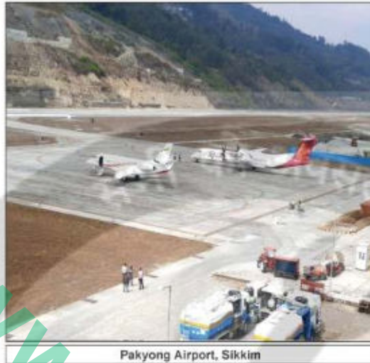
Pakyong Airport, Sikkim

UDAN scheme has immensely benefitted several sectors pan-India including Hilly States, North-Eastern region, and Islands. UDAN has a positive impact on the economy of the country and has witnessed an excellent response from industry stakeholders especially airlines operators and state governments. The scheme has provided connectivity across the