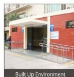
Built Up Environment