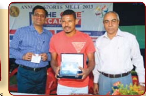
Elastico 2013 Inter College Football Tournament won by HIT-K