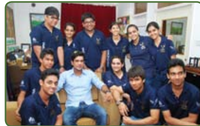
Eminent Cricketer Laxmi Ratan Shukla

Youthopia 2013 Annual Cultural Fest of THS was celebrated from 3 rd May to 5 th May 2013. During the fest Eminent Cricketer Laxmi Ratan Shukla and Tabla Maestro Bikram Ghosh were felicitated. There were 14 participant schools & 37 innovative activities.