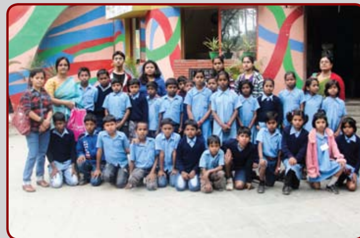
Visit for the Suryakiran students was organized to Rose Valley Park

Suryakiran students were highlighted in a documentary film on Health and Hygiene arranged by Vigyan Prasara, a unit of Department of Health and Hygiene, Govt. of India