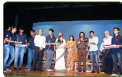
Eminent Tabla Maestro Bikram Ghosh (Fourth from the Right)