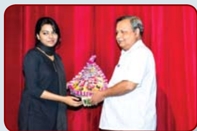
Film Festival HIT-K