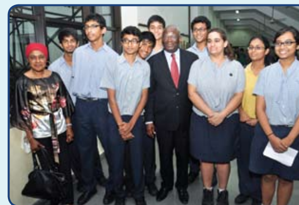
Professor Ibrahim Agboola Gambari (fourth from right)