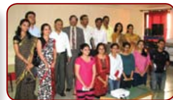
National Science Day at HIT-K by BT dept