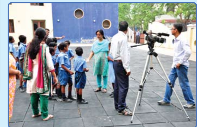
Students during the Shooting