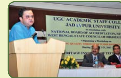
Hon'ble Minister of Education Govt. West Bengal Prof. Bratya Basu