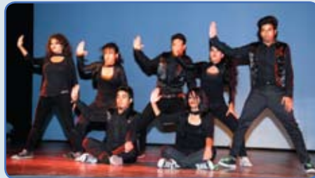
Students engaged in different activities during Elecia

Elecia 2013 HIT-K annual cultural fest was held during 4 th May to 6 th May 2013. There were 30 number of activities and 20 participant colleges. The closing ceremony of Elecia witnessed a marvellous performance by Bombay Vikings which included Neeraj Sridhar and his team