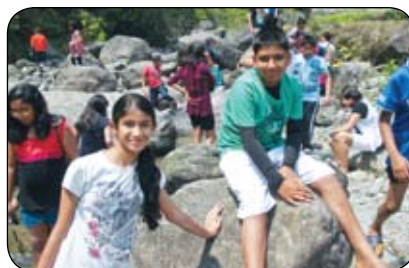
Dooars Trip (Class VI)