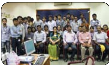
3 rd Year B.Tech (Chemical Engineering) students went for an Industrial Visit to Haldia Petrochemicals Ltd.