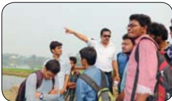
2 nd Year B.Tech (Civil Engineering) students went for a site visit to Belur Railway Bridge Project.