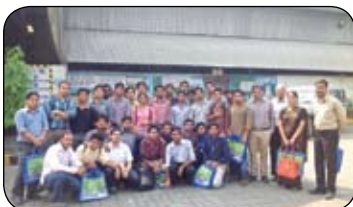
2 nd year B.tech (Mechanical Engineering) students visited Kiswok Industries.