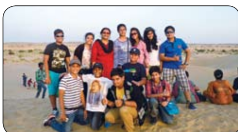
Rajasthan Trip (Class XI)