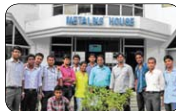
3 rd year B.Tech (Mechanical Engineering) students went for an Industrial visit to Metalics House.