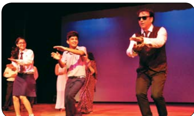
❖ Eminent Actor Govinda visited THS on July 5 th 2014.