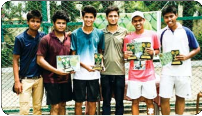
❖ Advantage Intercollege Lawn Tennis competition was organized by HIT-K on 9 th April 2014.