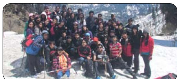
Manali Trip IGSC (Class X)