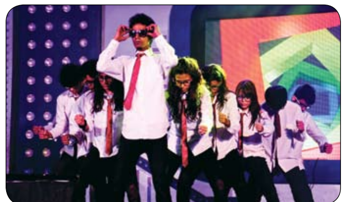
❖ Annual Fest "EPIGNOSIS 2014", was organized by the Students' Council (THA), on 21 st and 22 nd Feb 2014.