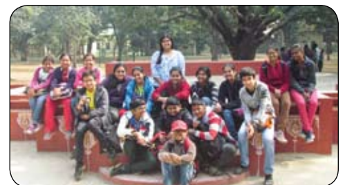
Shantiniketan Trip (Classes VI and VII)