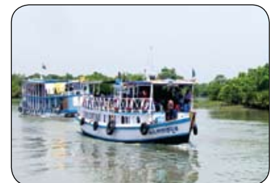
Sunderbans Trip (Class VII)