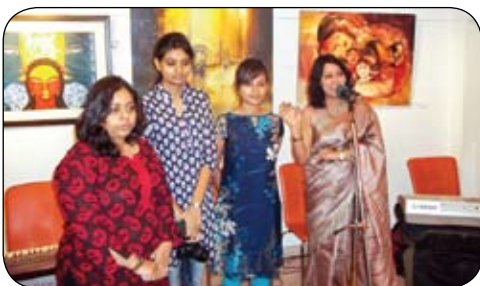
HBS students participating in Gallery Gold