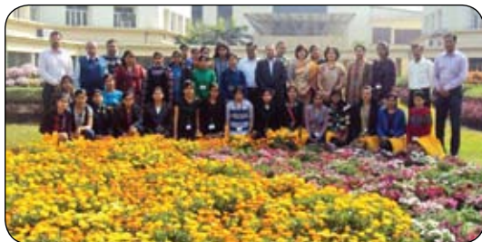
Members from GDC Memorial College

❖ Students from GDC Memorial College visited Heritage Group of Institutions from 22 nd to 27 th January 2014 as a part of their Excursion programme to Kolkata.