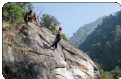
Corbett National Park Trip (Class VI)