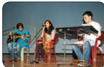
4 th Film Festival

❖ Pravasana Club of HIT-K organized the 4 th Film Festival and a Photography and Painting exhibition on 7 th and 8 th February 2014.