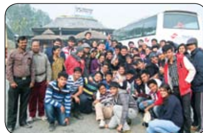
Saat Tal Trip (Classes V and VI)