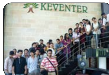
4 th year B.Tech (Biotechnology Engineering) students visited Keventer Group.