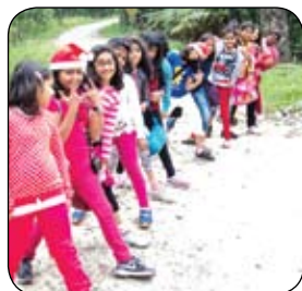
Kerala Trip (Classes IV and V)