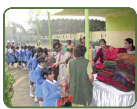
Distribution of Blankets to the children of Suryakiran School