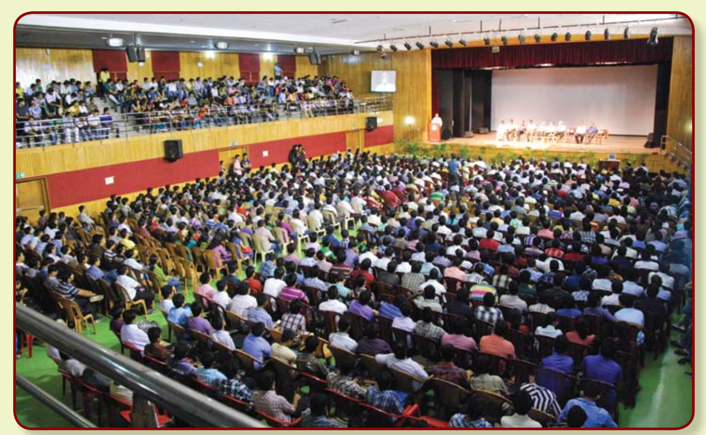
The audience at the Campus Orientation Meeting for Professional, Academic and Social Success (COMPASS) 2012 (induction and orientation programme for the new B.Tech students).