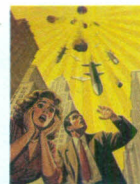
Cover illustration by Greg Smallwood

Our highly subjective take on the latest buzz in artificial intelligence.